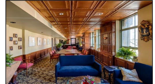
SELMA TRUSTEE LOUNGE