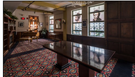
BASSETT VIP LOUNGE