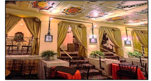
ARETHA'S JAZZ CAFE