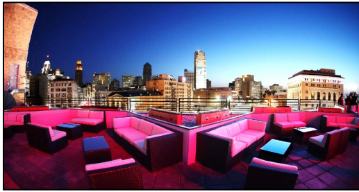
3 FIFTY ROOFTOP TERRACE